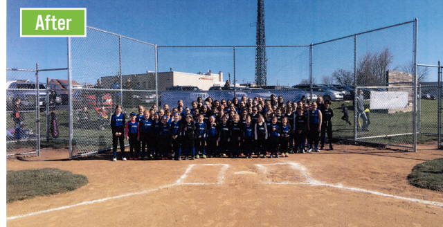
East Norriton Girls Athletic Association | Norristown, PA.