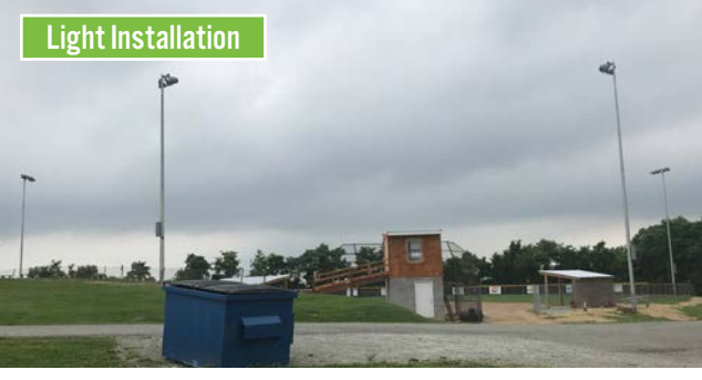
Westfield Little League | Westfield, Mass. Yough Little League | Smithton, PA.