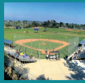
CARL E. STOTZ LITTLE LEAGUE COMMUNITY AWARD Little League